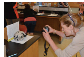
Participant in the 2012 STEM DIGITAL Workshop

“It was a great week overall and as a chemistry teacher, I believe that this was probably the most relevant summer institute of the three that I have participated in.”