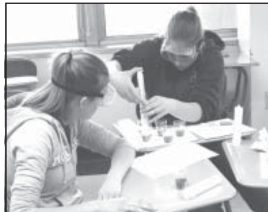
Additional information is online at www.umassk12.net/adventures

-Very interesting! Great activities! -Good to have the female assistants present. Good role modeling! -It is very important that young girls are exposed to math/science concepts early in their academic lives. This program shows the girls that science is fun and is also for them. -The hands-on aspects were excellent!